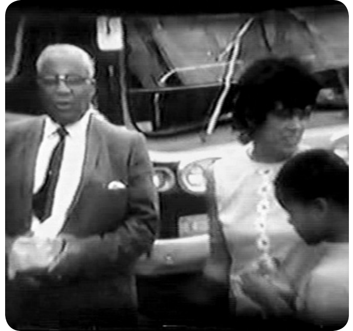
Martin Luther King, Sr., my mother and me

When I was in second grade, my father gave me a magazine about Dr. Martin Luther King, Jr. I read it many times. I admired Dr. King and his efforts to make the United States a place where all people are treated the same, no matter what color they are. I read about Rosa Parks and how she refused to cooperate when a bus driver demanded that she give up her seat just because she was black. Mrs. Parks and Dr. King worked to end unfair laws. They were part of a campaign called the Civil Rights Movement. I studied Dr. King's famous "I Have a Dream" speech. I had read it so many times that I memorized it.