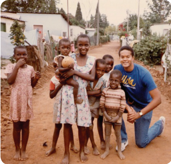
Children in Zimbabwe