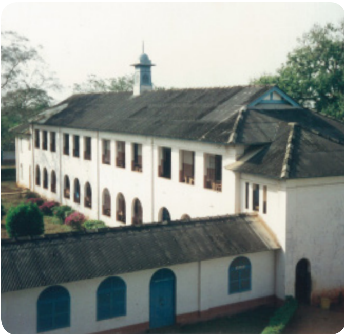
School Building in Accra, Ghana

This book will show you how to go after your dream. When you climb the mountain toward your dream, if you want to get to the top, you must start with the first step. This book will show you how to take those first steps toward your dream.