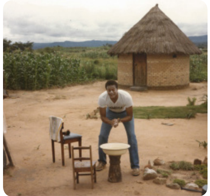
Washing my face while visiting the countryside in Zimbabwe