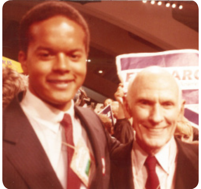
Former US Senator Alan Cranston from California

Do not wait. You can start at any age. Before I was ten years old, I had met Dr. King's father, written to a president, and worked in a political campaign. Start living your dream today! Read about it! Write about it! Do something!