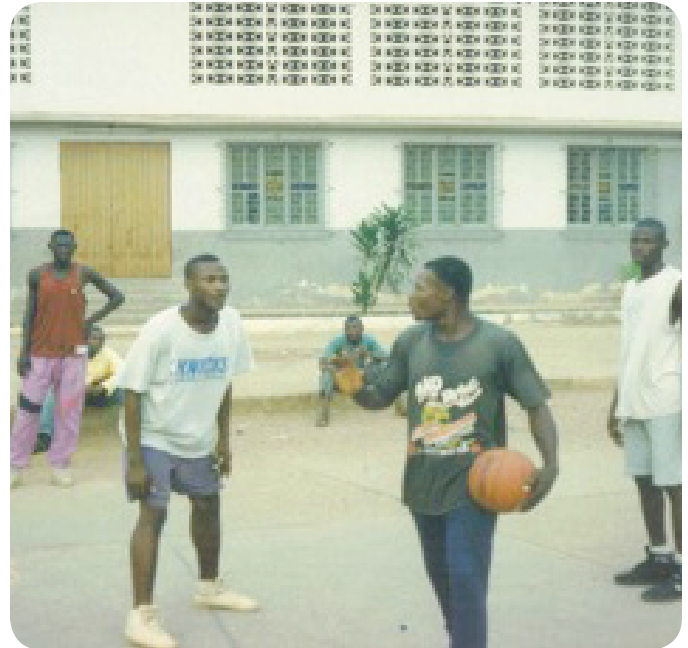
Basketball players practicing in Nima

Living your dream can make your life fun and exciting. Living your dream can make you happy. Living your dream does not happen by chance or by luck. You have to take action to make your dream come true. Living your dream is like pursuing a great adventure, like climbing to the top of a mountain. It will be hard. Sometimes you may think you cannot get there. Sometimes you will fall down. Your dream can come true if you keep climbing and never give up. First you must decide what your dream is, and then you must get started.