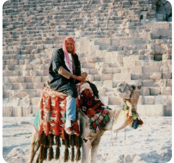
Riding a camel in Egypt in front of a pyramid